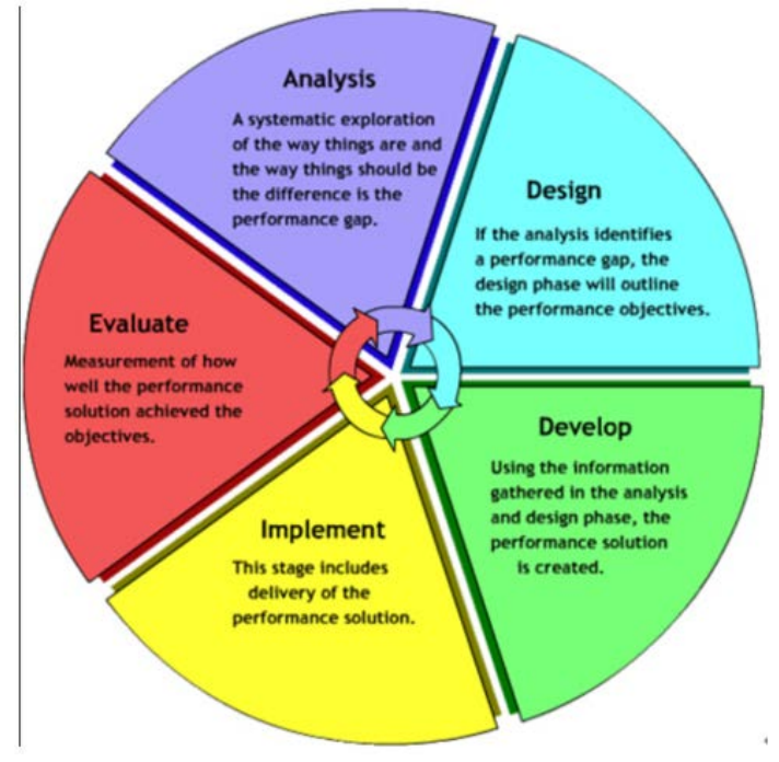
Figure 1. The ADDIE model.

The ADDIE Process categorizes the instructional design process into five phases: Analysis, Design, Development, Implement, and Evaluation. These five phases interact each other, which is shown in the following.